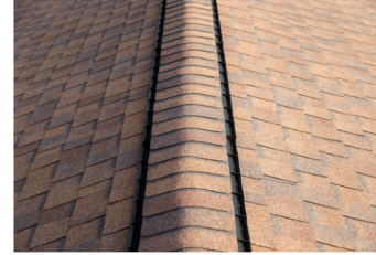
Shingle Roof Vent $50

A $25 gift can provide Habitat with the funds needed to purchase the new door locks that provide a safe, secure home for a family.