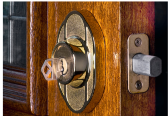
Door Lock $25

A $10 gift can provide Habitat with some of the 2x4's needed to frame the walls of a new home.