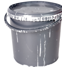
15 Gallons of Primer $150

A $100 gift provides Habitat the ability to purchase insulation for the walls of the home, keeping it cooler in the summer and warmer in the winter.